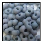
Left to right: Tilas, super duos, and peanuts