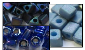
Triangles (top left), cubes (right) and hex beads (bottom)

Seed beads are also available in triangular shapes, hexagons , and cubes . Unlike the others, cubes are sized by millimeter, e.g., 1.5mm, 3mm and 4mm.